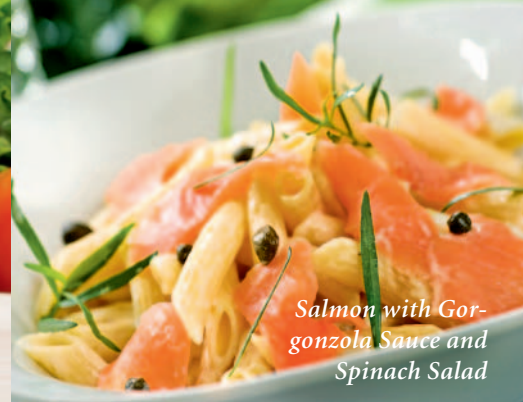
Salmon with Gor- gonzola Sauce and Spinach Salad

sunny side up and top spinach with eggs. Serve all together.