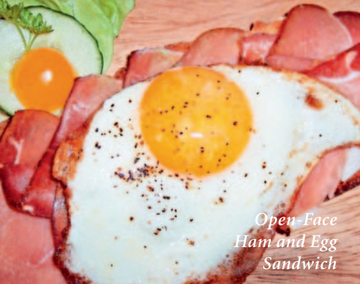
Open-Face Ham and Egg Sandwich