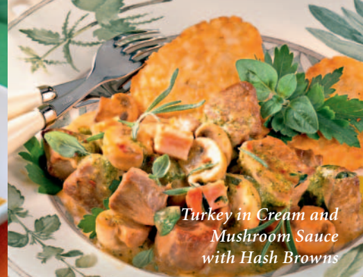
Turkey in Cream and Mushroom Sauce with Hash Browns