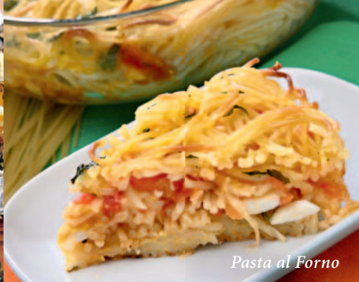
Pasta al Forno