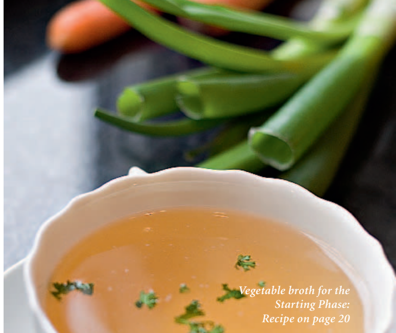
Vegetable broth for the Starting Phase: Recipe on page 20

The guidelines to the weight you've always wanted: Great recipes for each day. That's how you lose weight the quick and healthy way. Lunch and dinner recipes are interchangeable within one day.