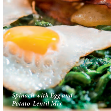
Spinach with Egg and Potato-Lentil Mix