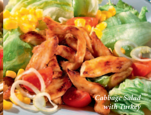
Cabbage Salad with Turkey

cinnamon, marjoram, parsley, salt and pepper, 2 slices whole wheat bread