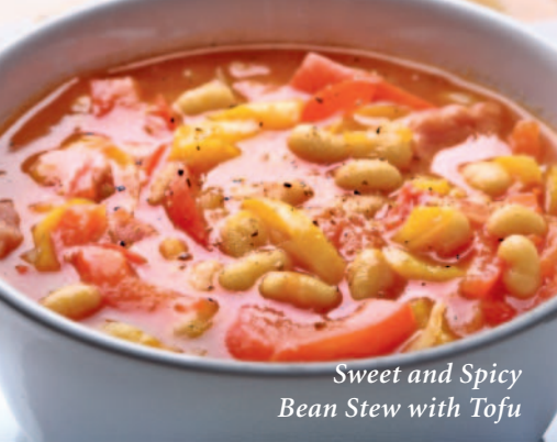
Sweet and Spicy Bean Stew with Tofu