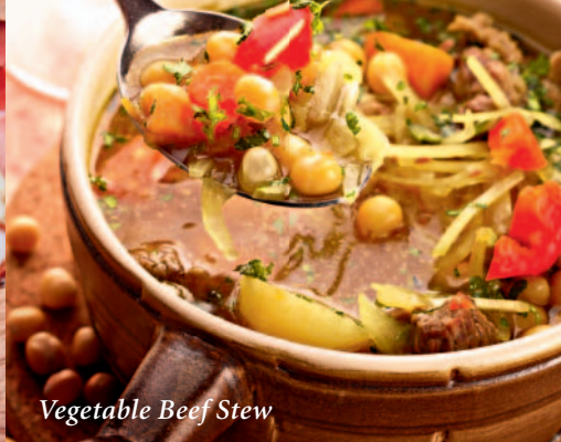
Vegetable Beef Stew